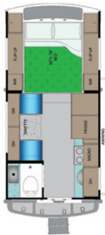
Citation Explore 9'-2" 350/3500+ Short Box Truck