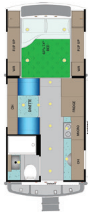
Citation Explore 10'-8" 350/3500+ Long Box Truck