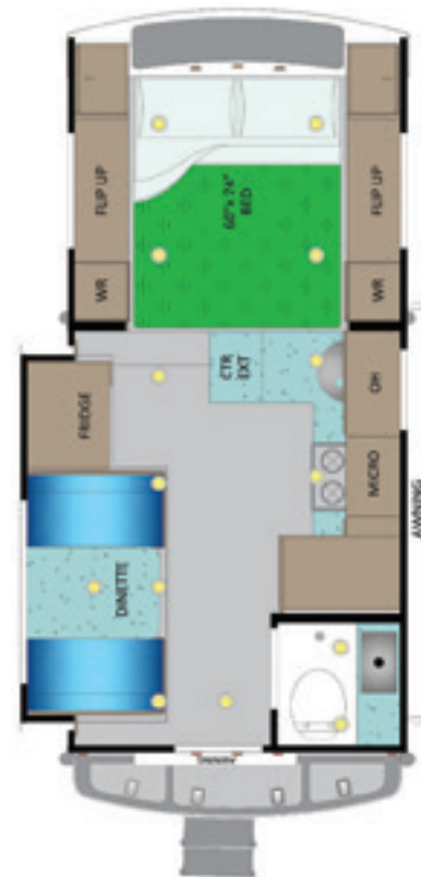
Citation Explore 10'-2" 350/3500+ Long Box Truck