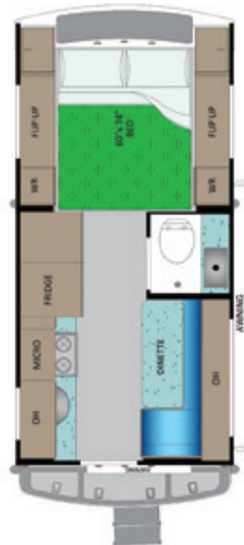
Citation Explore 9'-6" 350/3500+ Long Box Truck